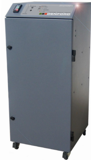
AD-ORACLE Extraction Unit

Microsoft Windows, XP and above. 2x USB 2.0 Connection.